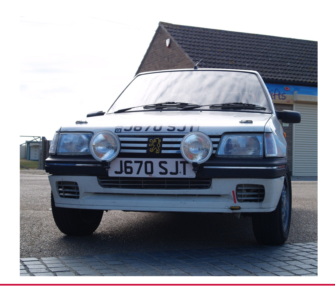
Martin's Pug 205 Rallye at GY Wheels Festival